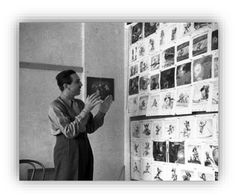
Figure 2. Walt Disney and storyboard.

In the early 1960s, Hughes Aircraft Company adopted storyboards from the film industry as a business communication tool. The aircraft engineers used the storyboard as a way to organize subject matter in a page-limited document.<sup>1</sup>